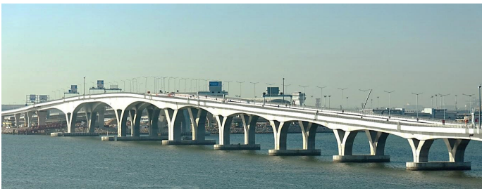
Overview of the Southern Connection and North Lantau Highway with Y-shaped sea viaduct piers resembling a flock of seagulls flying over the waters.

The Northern Connection consists of a 5 km long dual-carriageway sub-sea tunnel (the Tuen Mun-Chek Lap Kok Tunnel) connecting the HZMB Hong Kong Port to Pillar Point in Tuen Mun South. A 2 km long viaduct and a vehicular underpass connect the new link to the local road network. The Northern Connection was fully commissioned in December 2020.