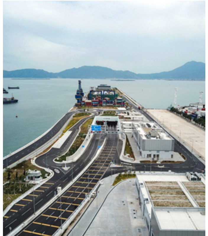
Overview of the North Portal

The TM-CLKL offers a more direct route for road users travelling between the NWNT and Lantau as well as the HKIA. The journey time from Tuen Mun South to the HKIA can be reduced by about 20 minutes.