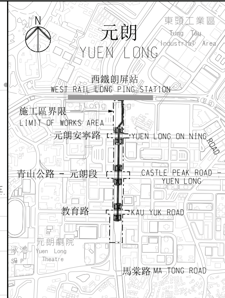
位置圖 LOCATION PLAN 比例 SCALE 1:5000