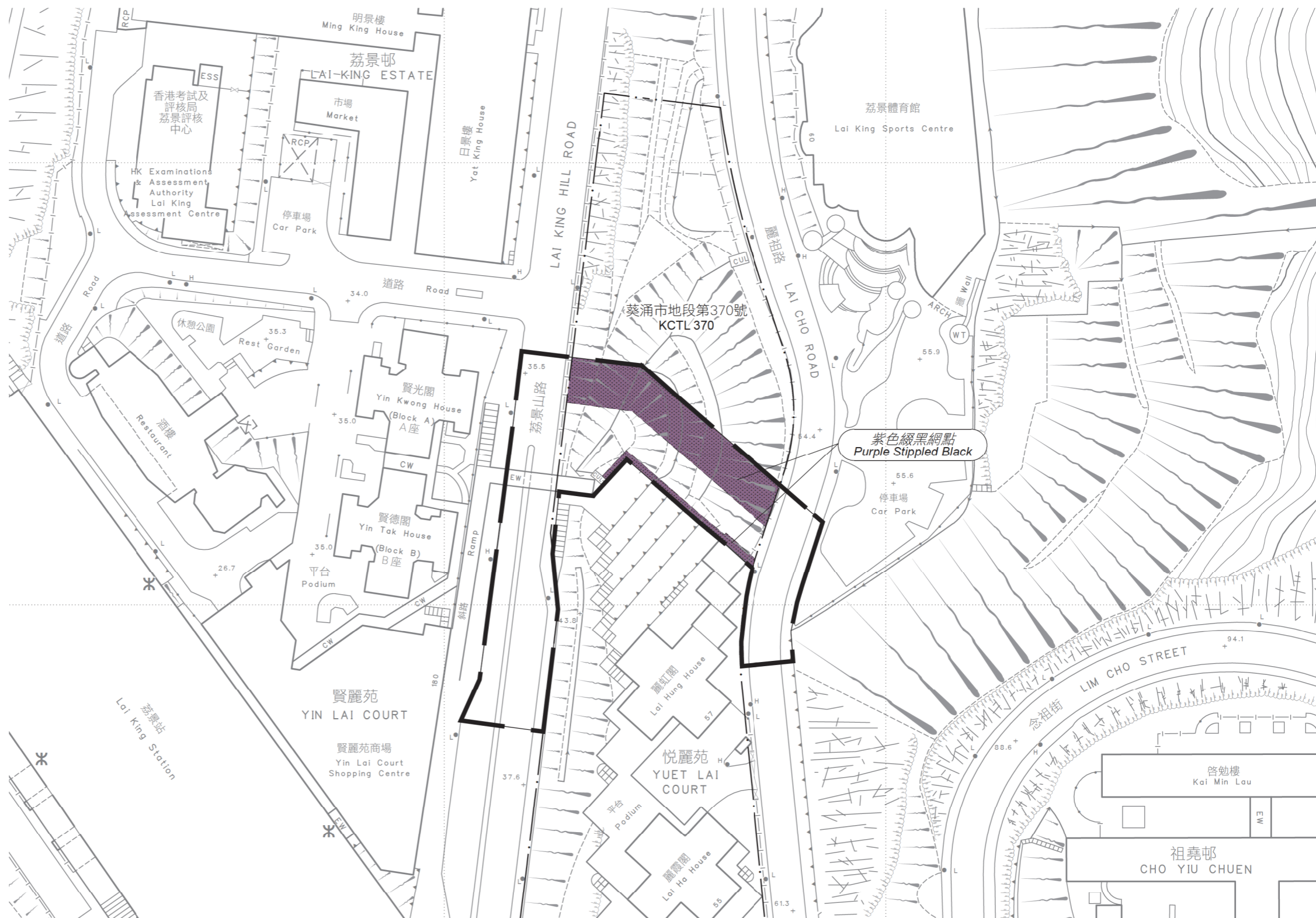
比例尺 SCALE 1:1 000