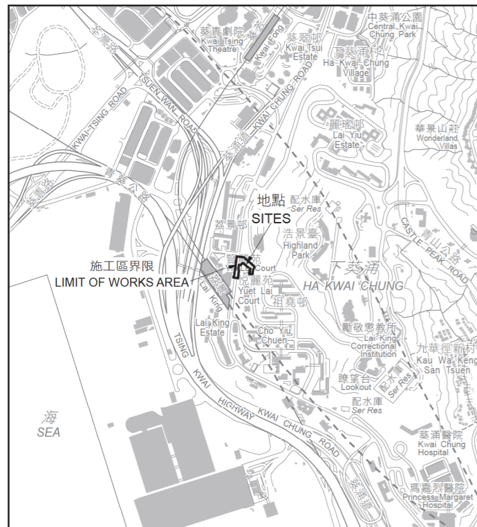
比例 SCALE 1:20 000